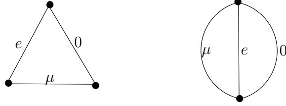
FIGURE 1. Simple examples of graphs G with the property that T_{\mathcal{H},/}^{\Lambda'_0}(G, e) (left) or T_{\mathcal{H},-}^{\Lambda'_0}(G, e) (right) contains negative terms.

graph G shown on the right side of Figure 1, we have T_{\mathcal{H}}^{\Lambda_0}(G/e) = Y_\mu z_{[\Gamma_b]} while \pi/T_{\mathcal{H},0}^{\Lambda'_0}(G, e) = y_\mu z_{[\Gamma_b]} , where \Gamma_b is the graph that consists of a single zero loop edge. Thus T_{\mathcal{H},/}^{\Lambda'_0}(G, e) = (Y_\mu - y_\mu)z_{[\Gamma_b]} .